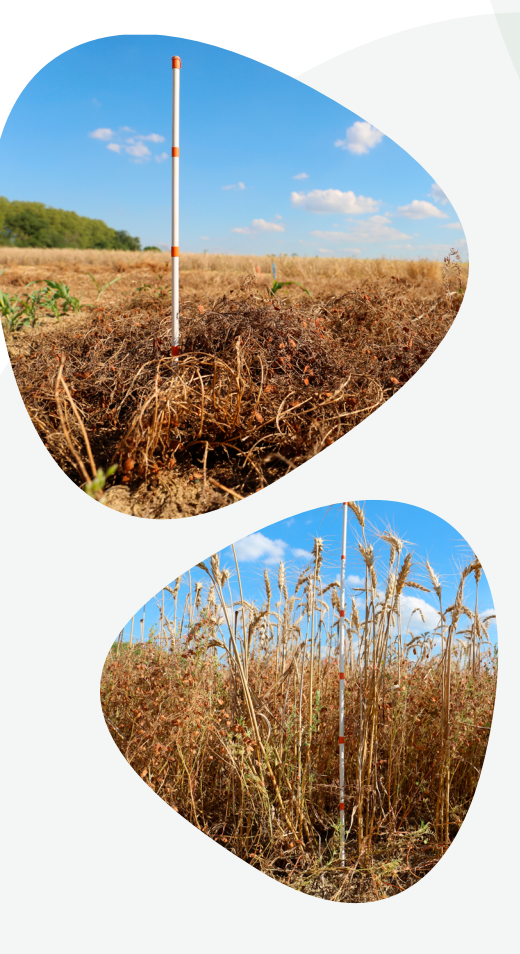
Fig. 1. These pictures highlight that spring wheat in intercrops (below) reduces lentil lodging at maturity compared to the sole cropped lentil (above) allowing the combine harvester to pick up most shoots by maintaining plants relatively upright (Viguier et al. 2018).

First of all, intercrops can reduce grain legume lodging at maturity compared to the sole crop ( Fig. 1 , as shown by Viguier et al. in 2018). This maintains the shoots relatively upright allowing the combine harvester to cut these efficiently.