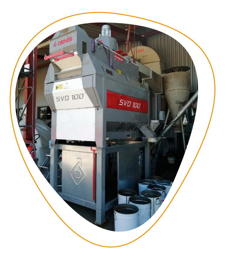
Fig. 4. Vibrating cleaner SVD100 from Etablissements Denis used to demonstrate the feasibility of the separation of species mixture and the resulting economic benefit

ReMIX has tested the feasibility of separating the products using a vibrating cleaner SVD 100 from Etablissements Denis in order to evaluate the efficacy for various species mixtures on-farm ( Fig. 4 ).